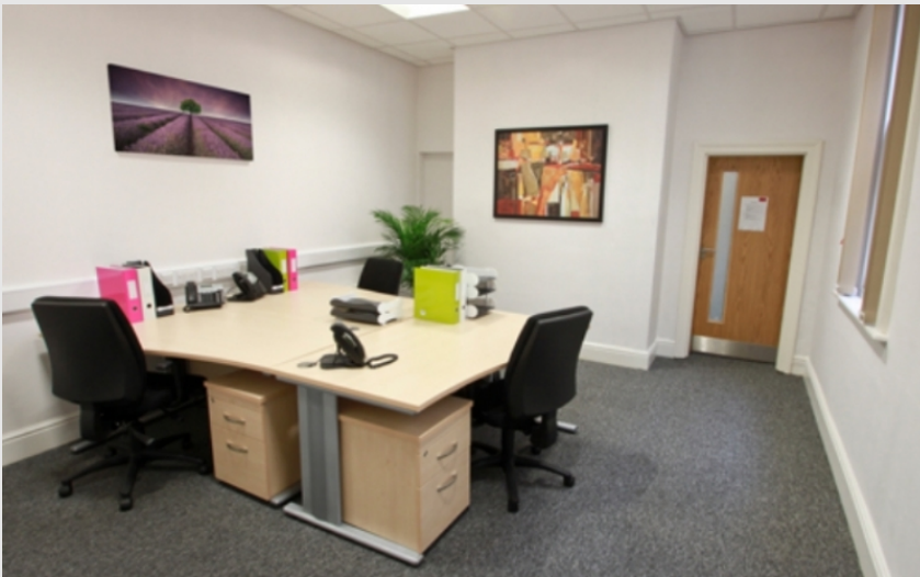
Located on the 1st floor, close to Main Reception

Foxhall Business Centre, Two King Street, Nottingham NG1 2AS