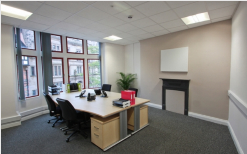
The office has sufficient room to accommodate 5-6 people

Foxhall Business Centre, Two King Street, Nottingham NG1 2AS