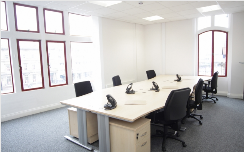
Overlooking Old Market Square & The Council House

Foxhall Business Centre, Two King Street, Nottingham NG1 2AS