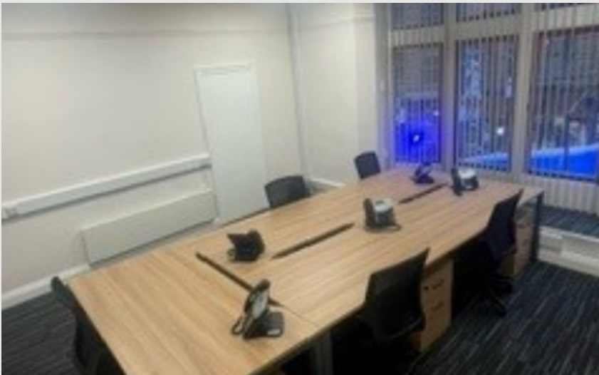
The office has sufficient room to accommodate 5-6 people

Foxhall Business Centre, Two King Street, Nottingham NG1 2AS