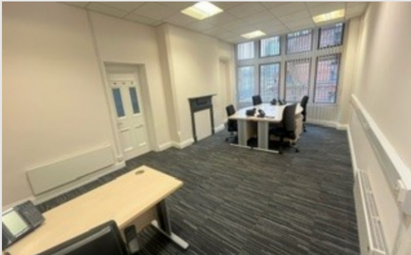
4-5 Workstations with a Great View of the Market Square

Foxhall Business Centre, Two King Street, Nottingham NG1 2AS